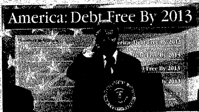
PRESIDENT CLINTON PRESENTS THE FISCAL BUDGET PLAN OF HIS ADMINISTRATION.