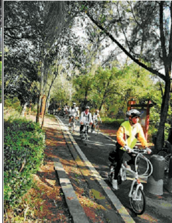
Miaoli County Green Light Breeze Bicycle Path 苗栗縣綠光海風自行車道

In accordance with a special budget of NT$3 billion set aside for the Bicycle Path Network Construction Plan under the “Economic Revitalization Policy - Project to Expand Investment in Public Works”, appraisals for the year 2011 were conducted. Since the inception of the plan in 2009, the Sports Affairs Council (SAC) of the Executive Yuan had planned for the construction of bicycle paths for land and coastal round-island trips. As of the end of 2011, approximately 1,000km of bicycle path had been constructed.