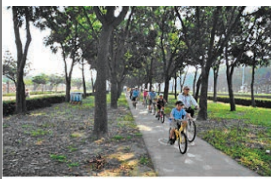
Chiayi City Bicycle Path Construction Plan (third phase) 嘉義市自行車道路網專案計畫(第三期)