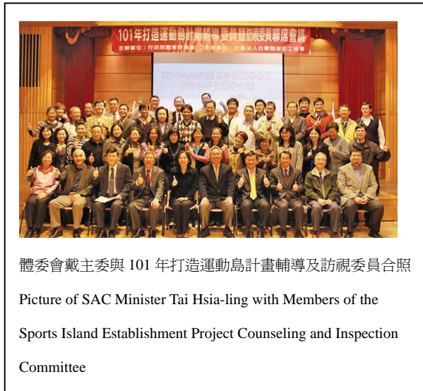
體委會戴主委與 101 年打造運動島計畫輔導及訪視委員合照 Picture of SAC Minister Tai Hsia-ling with Members of the Sports Island Establishment Project Counseling and Inspection Committee

The 2012 Joint Conference for the Sports Island Establishment Plan Counseling and Inspection Committee was held in the morning of 18 January, with SAC Minister Tai Hsia-ling awarding certificates to 19 counseling and 51 inspection members. During the meeting, Minister Tai stated that the program is its third year, and the joint efforts of all counties and cities, especially the assistance of respective counseling and inspection members of the Committee, are crucial to the success