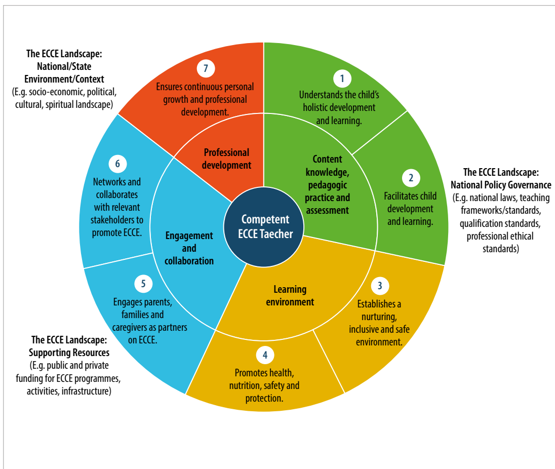
Figure 3. The ECCE teacher competency framework for Southeast Asia