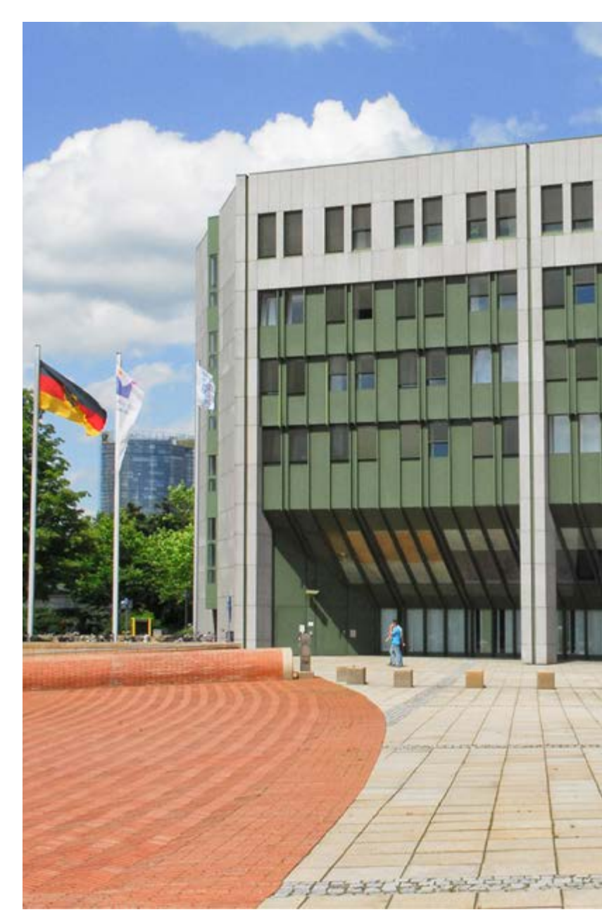
Federal Institute for Vocational Education and Training (BIBB).

Further information on the German Office for International Cooperation in VET (GOVET) is available at: www.bibb.de/zentralstelle