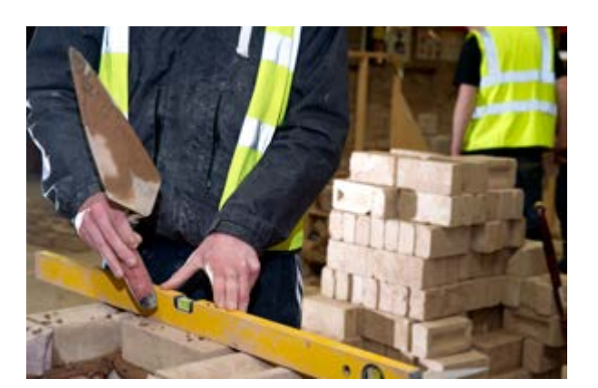
Laying the foundations for sustainable VET-development in the partner countries.

initiate and support training alliances between AHKs, chambers of the partner country, the two sides of industry and industrial organizations in the partner country, German companies and companies in the partner country; cooperate with vocational schools.