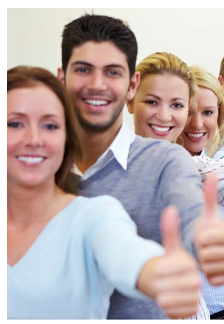
Combating youth unemployment, strengthening the development of skilled staff.